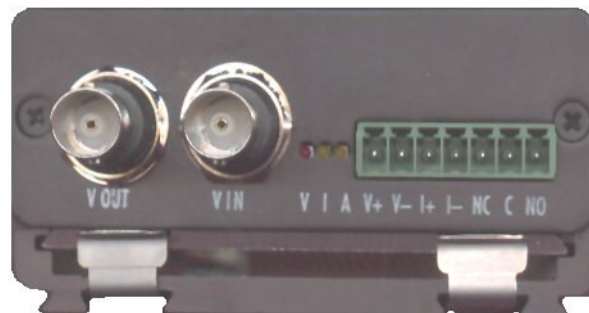
Figure 1B – DVMD1/1X Front View on Mounting Base